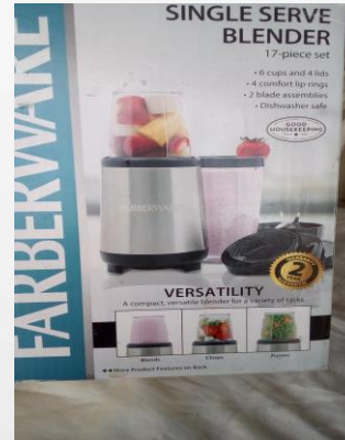
SAPC-21-09-0003 Farberware 17 Pc Blender SET $5,400.00