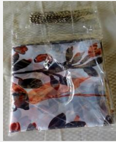
Shower Curtain with Hooks