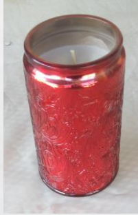
RED SCENTED CANDLE