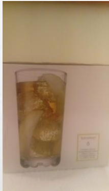
SET OF 6 DRINK GLASSES SAPC-21-08-008 $300 /SET