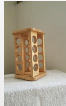
WOODEN SPICE RACK SAPC-21-08 -010 $3000