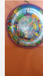
Wall Hung Platter SAPC-21-08-0020 $600.00