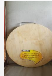
Wooden Cutting Board SAPC-21-08-0019 $1,500.00