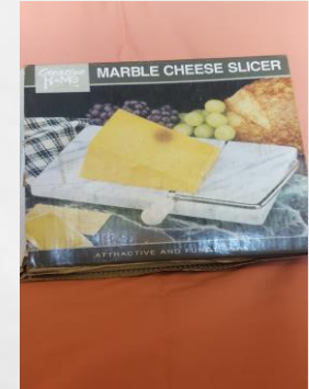
Marble Cheese Board SAPC-21-08-0021 $2,000.00