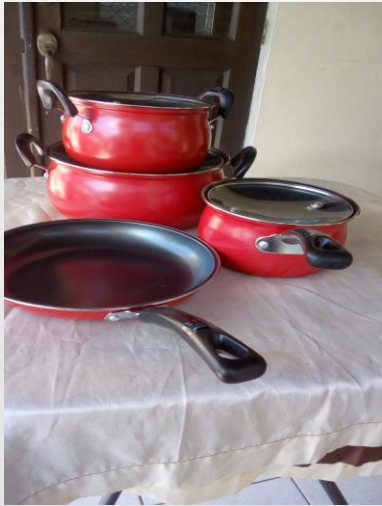
SAPC-21-09-0001 3 Pots with covers & Frying Pan $4,000/SET