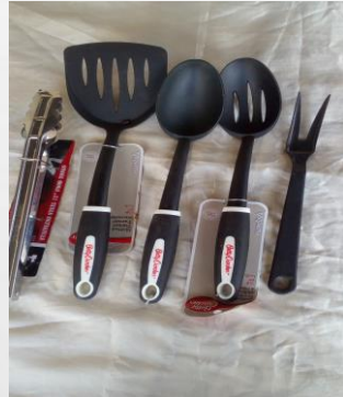
SAPC-21-09-0002 Betty Crocker 5 Pc Cooking Utensils $1,800/SET