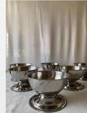
SAPC-21-09-0004 6 Silver coloured Metal Dessert Cups $3,000/SET