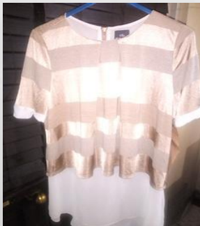
Brown & Cream Striped Blouse-Size 10 SAPC-21-08-0023 $1,000.00