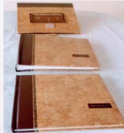
Journal & Photo Album SAPC-21-08-0015 $2,500.00