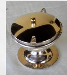
STAINLESS STEEL SUGAR BOWL SAPC-21-08-013 $2000