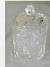
GLASS CANDY JAR SAPC-21-08-011 $1000