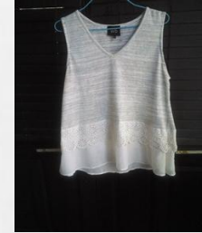
Two toned grey blouse with lace - Large SAPC-21-08-0027 $1,200.00