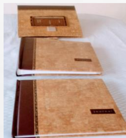
Journal & Photo Album SAPC-21-08-0015 $2,500.00