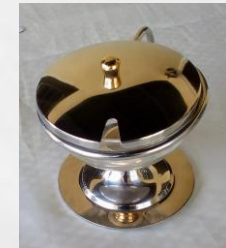
STAINLESS STEEL SUGAR BOWL SAPC-21-08-013 $2000