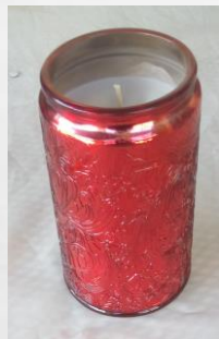
RED SCENTED CANDLE