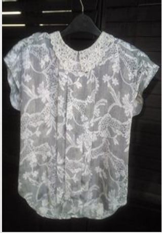
Blue & White petite blouse with lace collar SAPC-21-08-0022 $1,500.00