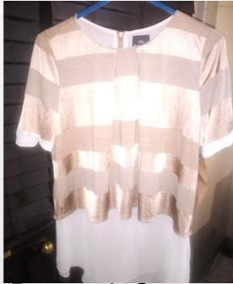
Brown & Cream Striped Blouse-Petite fit SAPC-21-08-0023 $1,000.00