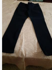
REGULAR JEANS SIZE 16 @ $1000 SAPC-21-08-004