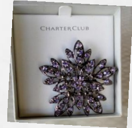
CHARTER CLUB BROACH @ $1500 SAPC-21-08-0017 (1)