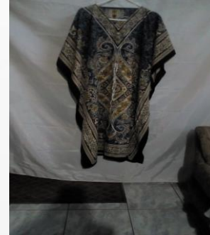
Multi coloured Dashiki – Large SAPC-21-08-0025 $5,000.00