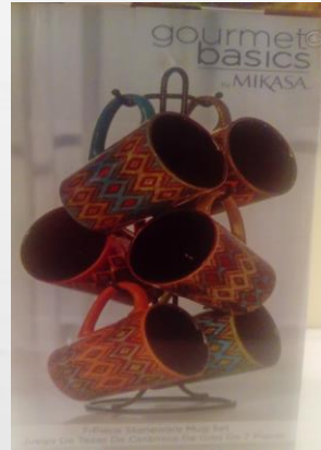
SET OF 6 COFFEE MUGS WITH RACK SAPC-21-08-009 $1500