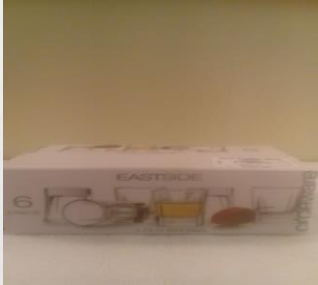
SET OF 6 SHOT GLASSES SAPC-21-08-007 $300 /SET