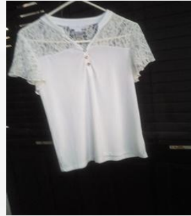
Emma Olive petite blouse with lace top SAPC-21-08-0024 $1,500.00