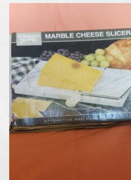
Marble Cheese Board SAPC-21-08-0021 $2,000.00