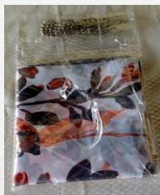
Shower Curtain with Hooks