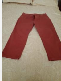
SIZE 14 - CAPRI JEANS BURNT ORANGE @ $700 EACH SAPC-21-08-006