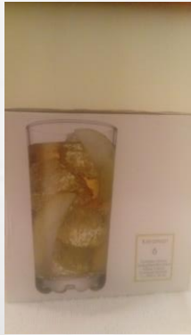
SET OF 6 DRINK GLASSES SAPC-21-08-008 $300 /SET