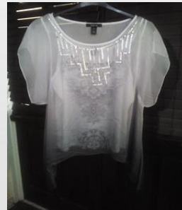
Two toned sheer mauve blouse with under blouse-Petite fit SAPC-21-08-0026 $1,200.00