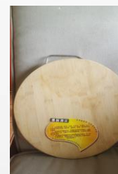
Wooden Cutting Board