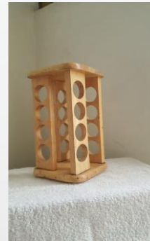
WOODEN SPICE RACK SAPC-21-010 $3000