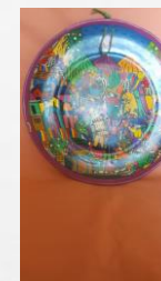
Wall Hung Platter