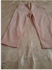
SIZE 14 - CAPRI JEANS PEACH @ $700 SAPC - 21-08-003